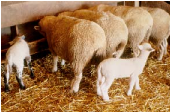
Table 2. Suggested daily rations for ewes (late pregnancy).

Determine how long a breeding season you want and remove the rams at the end of this time. A 34-day breeding season allows all ewes to return to heat if they don't conceive. Some have the opportunity to cycle three times. A longer breeding season tends to string out the lambing season, thus making management of lambs more difficult.