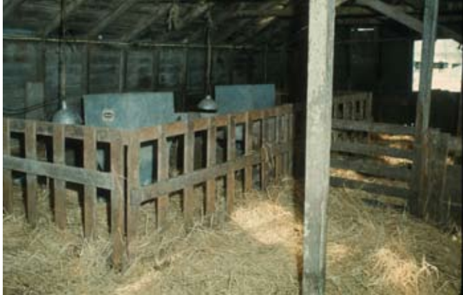
A creep feeding area set-up.