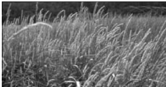
Reed Canary Grass (shown here) is an example of a non-native invasive species.

Problem aquatic and terrestrial plants are often referred to as invasive non-native plants or invasive weeds . Most of the problem aquatic and terrestrial plants in Western Washington are not native to this area, having been introduced to our region through hu-