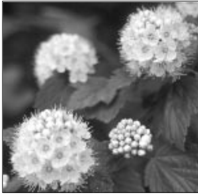
Pacific Ninebark- example of a native shrub that is commonly used in stream restoration

Native plants are plants that occur naturally in your region. For example, Douglas fir is a native plant in much of Western Washington. English holly is not a native plant in Washington because it was originally brought here by Europeans (it is, however, a native plant in England). Plants native to a specific region have grown alongside the native insects, fungi, plant diseases, wildlife, and other native plants for thousands of years. Plants native to our area are adapted to growing in our region's soils and climate, and so generally require less maintenance (such as watering) than do non-natives.