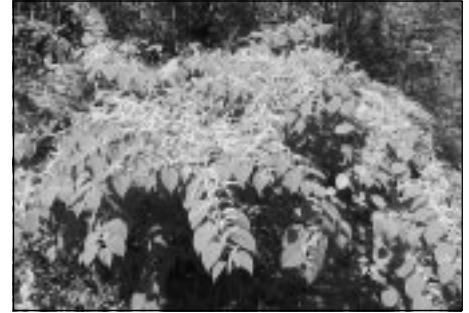
Japanese Knotweed - example of a noxious weed that is abundant in Whatcom County

As the relatively new field of restoration ecology evolves, more information will become available as to the importance of specifying coinciding seed zones as seed sources for plant material to be used for restoration projects (i.e. whether local