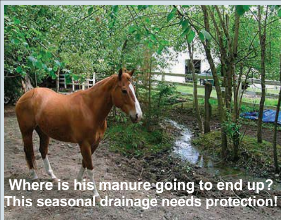
Where is his manure going to end up? This seasonal drainage needs protection!