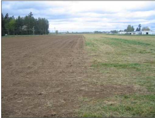
A May 12th Field Day will review a comparative study of conventional till and no-till technology.