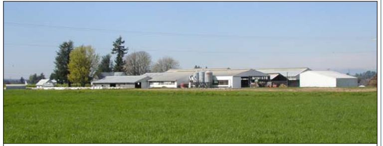
The Faber Dairy near Everson is situated on Barnhardt gravelly loam and Pangborn muck soil types.