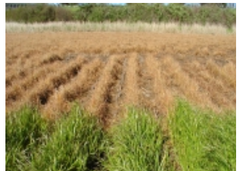
Yield and nitrate levels will be tracked in relay crop fields to compare areas that were sprayed out with areas that were not.

Relay crops (i.e. annual rye interseeded in corn at the 3 to 6 leaf stage) are currently being planted on more than half the silage corn ground in Whatcom County. The relay crops are grown here because of their superior ability, when compared to winter rye and wheat, to provide winter cover and take up residual nutrients after corn is harvested. The use of cover crops as a feed is increasing steadily. Shabtai Bittman, a research scientist at Ag-Canada's facility in Agassiz, B.C., introduced relay crops to this area. A concern he raised was that if relay crops are not harvested then they may add nitrogen to the cropland soil, instead of reducing it. The Conservation District would like to find out if relay crop management affects crop yield and residual nitrate levels after harvest in the fall. In a study the District hopes to begin this spring, soil nitrogen levels and crop yields will be tracked over the course of the growing season in relay crop fields receiving three different treatments within the same field. The treatments will include spraying out the relay crop (with glyphosphate), discing out the relay without spraying or harvesting it, and harvesting it prior to discing. In addition, some fields will receive only liquid manure and others only solid manure. The project will be supervised by Lynn Johnson, PhD, who is currently working for both WSU and the Conservation District.