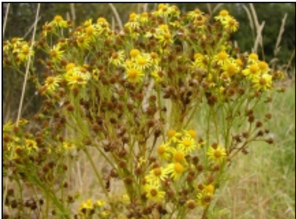
Tansy ragwort is toxic to livestock, causing irreversible liver damage. It should be removed from fields before it seeds out.

Sometimes the greatest danger to livestock is not what comes from outside the farm, but from what grows within it. If cattle and other livestock consume a weed called tansy ragwort, the weed's powerful toxins will cause permanent liver damage and even death. The most likely place for tansy ragwort to show up is in low maintenance areas that don't get clipped or mowed regularly. These are often areas such as heifer pastures (especially ones that are lightly wooded), fence lines, ditch banks, and manure pond dikes.