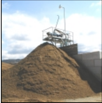
A manure separator is an example of a practice eligible for EQIP funds.

The Environmental Quality Incentive Program's (EQIP) priorities and eligibility rules for 2003 are still being discussed and should be finalized by the time the federal fiscal year begins in October. As of early September 2002, over 60 producers have signed up for 2003 EQIP funds. For the last six years EQIP funds have been focused on improving water quality in lowland areas of northwest Washington where livestock farming is concentrated. Clearly, practices funded by EQIP in the past have helped to improve surface water quality. In fact, water quality in agricultural areas has improved enough that a new priority for EQIP funds may emerge: the reduction of soil erosion from abandoned roads and undersized culverts in forestlands. If forestland erosion control becomes a priority, then it will likely be a good news/bad news situation for agriculture. The good news is that more funds will be available to improve environmental quality. The bad news is that, at a minimum, agriculture may begin sharing EQIP funds with forestry.