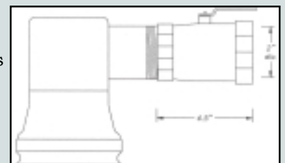
For safe operation of manure transfer pipelines - this diagram shows a riser cap with a 2" dia. brass ball valve for releasing pressure buildup in the pipeline during unused periods.